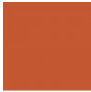
Terracotta, Ral 2013