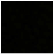
Black, Ral 9017