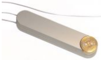
Flat power supply with integrated dimmer